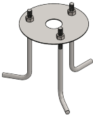
Foundation Kit GPR-130/JB3-8x150

Code Example :- DISK_BO_35_11_8_90_30_G_AC