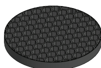
HL-87 (Hexcell Louvre )